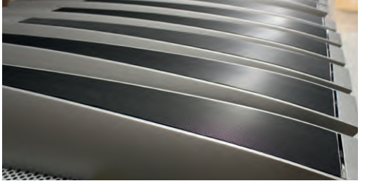
Assembly of the Scala 120