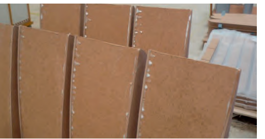
Housing after hardening is complete