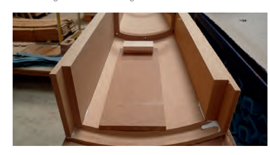
Gluing to the front and rear panels