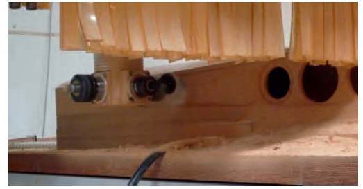
Milling into the speaker cut-outs