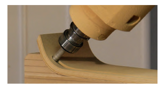
5D milling head in the diagonals

Four 90 mm aluminium chassis are deployed in the Scala for the low to mid-range tones. Two of them handle exclusively the base range while the other two are there for the bass and mid-range tones. The result is that the Scala not only reproduces the mid-range tones cleanly, it can also play the bass notes powerfully and accurately. And all that, with its ultraslim appearance. The four chassis are complemented by a 30 mm fabric calotte tweeter that reproduces high frequencies in a very refined and defined way. The best way to appreciate the impressive complete sound picture of the Scala is to experience it in person, by visiting your nearest specialist dealer, where you are guaranteed joy in listening.