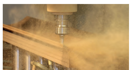
Milling in the multi-layer side panel