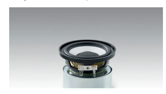
Low mid-range chassis